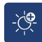
Up to 20% more light

High contrast and brilliantly blue light for most stylish and modern look on the road