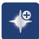
Up to 4,200 Kelvin

Bluish-white light for stylish xenon look