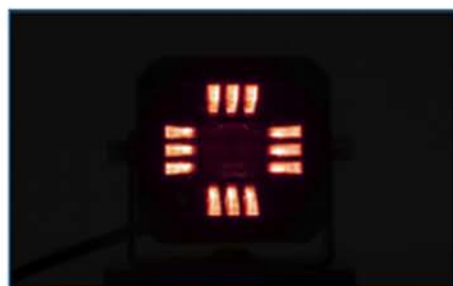
RED POSITION LIGHT

The Amber Position Light takes priority over the Red Position Light