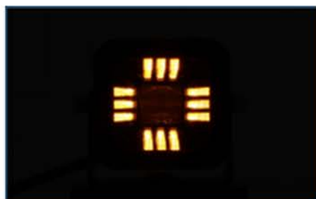
AMBER POSITION LIGHT